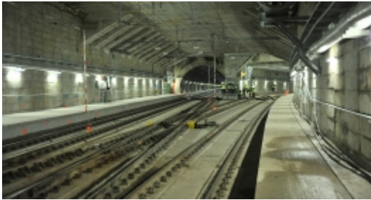
The Schuman-Josaphat tunnel