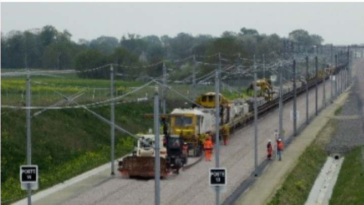
Haramain High Speed Rail corridor (2009 - 2014)